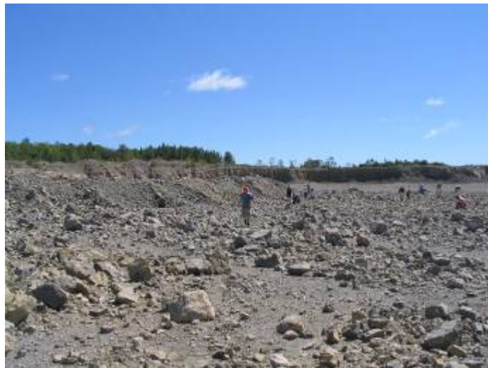
Participants searching for fossils at Stoneport Quarry