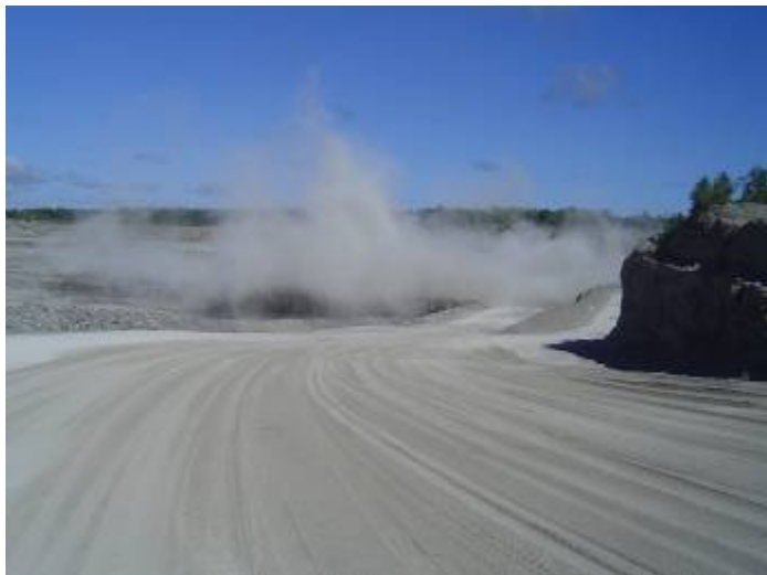
Just after blasting occurred at Stoneport Quarry