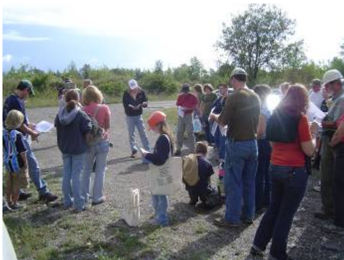
Participants at Rockport Quarry before collecting