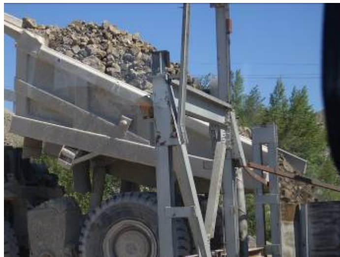
One of the large quarry trucks dumping rock into the crusher

After fossil collecting in the quarry, the trip participants broke for lunch, and then met in the early afternoon at the Thunder Bay National Marine Sanctuary in Alpena. There, the group was given a tour of the facility with explanations of the area the sanctuary covers and the number and age of various shipwrecks found within the sanctuary boundaries.